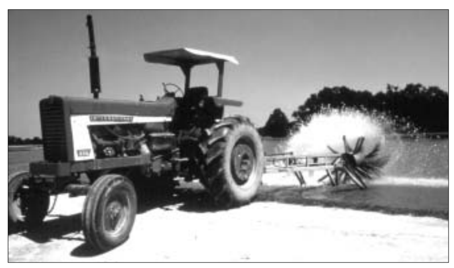
Figure 4. A sidewinder paddlewheel operated in a catfish pond.