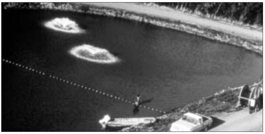
Figure 8. Two vertical pump aerators used in a fish-confinement area.

Electric paddlewheel design was systematically studied by Ahmad and Boyd (1988), who found that the best design consists of a 3-foot diameter paddlewheel with paddles that are triangular (135-degree interior angle) in cross section. Paddles are about 4 to 6 inches wide, with four paddles attached per row and spiraled in a staggered arrangement around the hub. Paddle depth is 4 to 6 inches. Paddlewheel speed should be about 90 rpm. Commercial designs similar to that proposed by Ahmad and Boyd have SAE values of 4.5 to 5.5 pounds O<sub>2</sub>/hp·hour, which is very good for surface aerators.