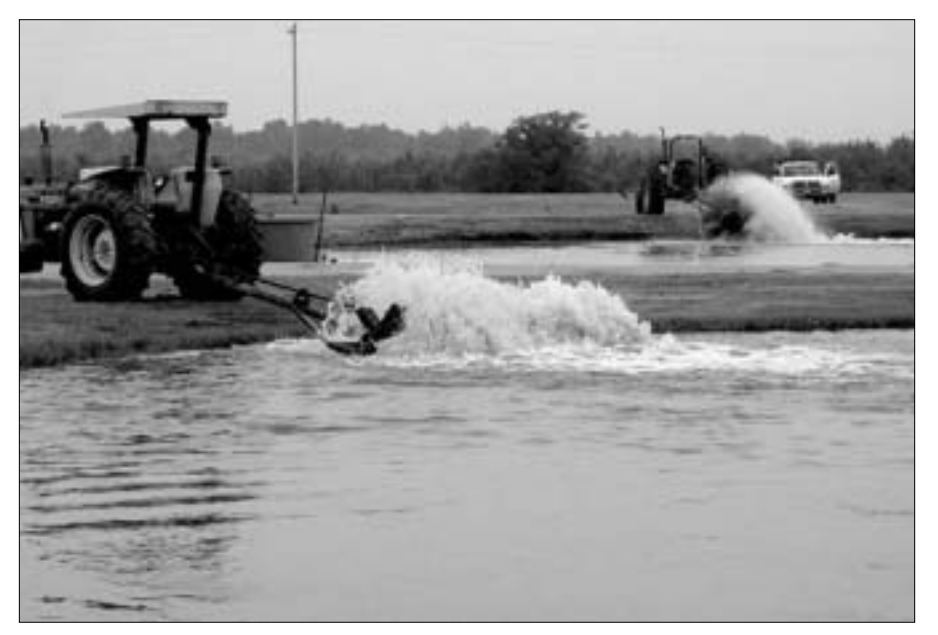
Figure 2. A tractor PTO-powered paddlewheel operated in a catfish pond. A sidewinder paddlewheel is in the background.

designs. For a given design, oxygen transfer can be increased by increasing paddle depth and hub rotation speed. Increased diameter, paddle depth and speed also increase the power required for operation.