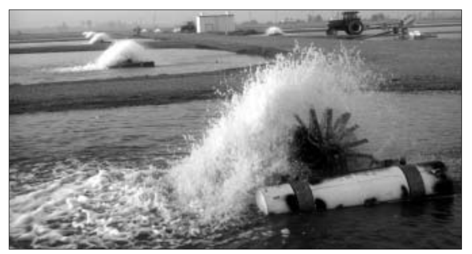
Figure 6. A series of electric paddlewheel aerators in operation.