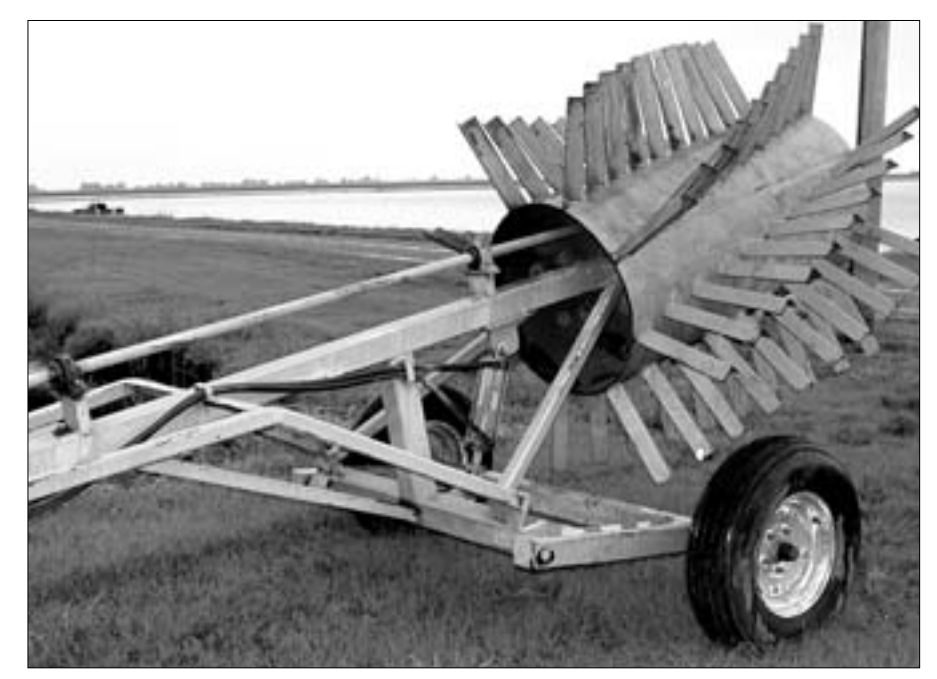
Figure 3. A sidewinder paddlewheel showing the orientation of paddles on the hub.

For routine, everyday use-where efficiency is important-most culturists prefer paddlewheel aerators powered by electric motors (Figs. 5 and 6). Electric paddlewheels used on commercial catfish farms are usually powered by 10- to 15-hp motors and have hubs 10 to 15 feet long. Electric paddlewheels are permanently anchored in each pond and individually controlled by switches on the pond bank. On some commercial aerators the paddle depth can be adjusted for optimum energy use and performance of the motor. The motor should draw about 90 percent of the full load amperage rating to provide maximum oxygen transfer and extend motor life.