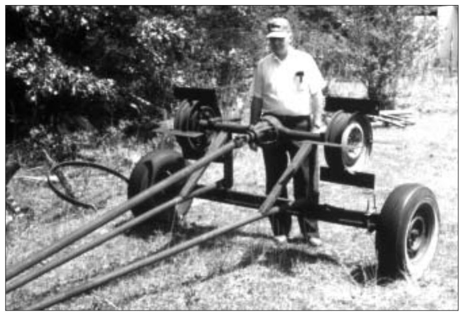
Figure 1. One of the first tractor PTO-powered paddlewheels. The device was fabricated from a truck rear end with rectangular paddles welded to the wheels.

Large-diameter paddlewheels transfer more oxygen than smaller diameter aerators, and flat paddles are less effective than other