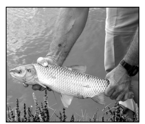
Figure 1. A grass carp.

relatively large scales; the head is broad and the belly rounded (Fig.1). The dorsal and anal fins are short with no spines and the caudal fin is deeply forked. Their jaws have simple lips with no teeth and they have no barbels (i.e., whiskers). Like other Cyprinidae, grass carp have pharyngeal teeth (i.e., in the throat). These pharyngeal teeth are in two rows and enable the grass carp to cut/shred the vegetation it consumes. Their flesh is white, firm and not oily, but the muscle mass contains "Y" bones. Grass carp flesh is considered a delicacy by many seafood enthusiasts.